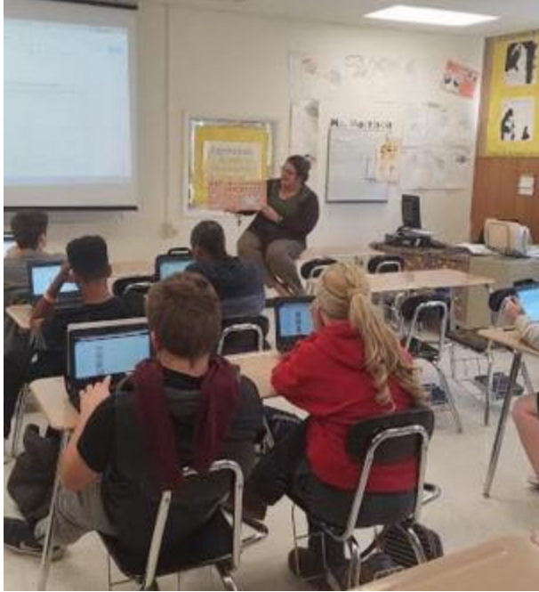
Figure 1. Class Read Aloud Photo. This was taken while I was giving directions for the assignment related to Mo Willems' Don't Let Pigeon Ride the Bus.

Table 2 summarizes all of the data the questionnaire given at the start of the study provided. Survey participants responded to this survey before picture books were introduced into their curriculum. Therefore, information from the questionnaire that was given at the start of the study shares the beliefs and feelings of the students when they entered the study. When asked, “What do you think of when you think of picture books?” on the questionnaire, 7.7% of the students responded that they think “they are for babies and children,” 38.5% said that “I think of my childhood, so picture books make me happy,” and 53.8%, the majority, said that picture books can be valuable but they “can’t think of the last picture book” they read. Most of the students, 58.3%, revealed that they feel the best when a teacher reads to them, and most students responded in a way that showed the participants’ overwhelming insecurity with reading a book independently